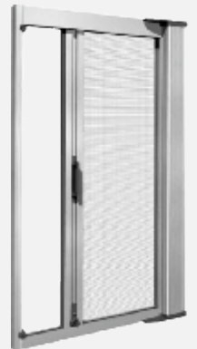
Pleated Single Mesh