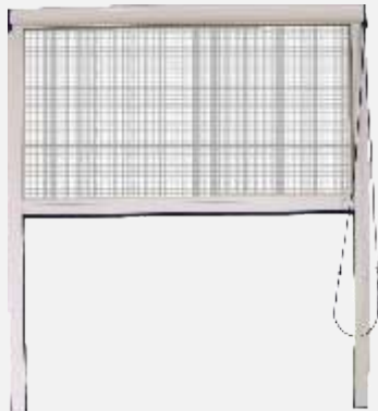
Zig Zag Vert