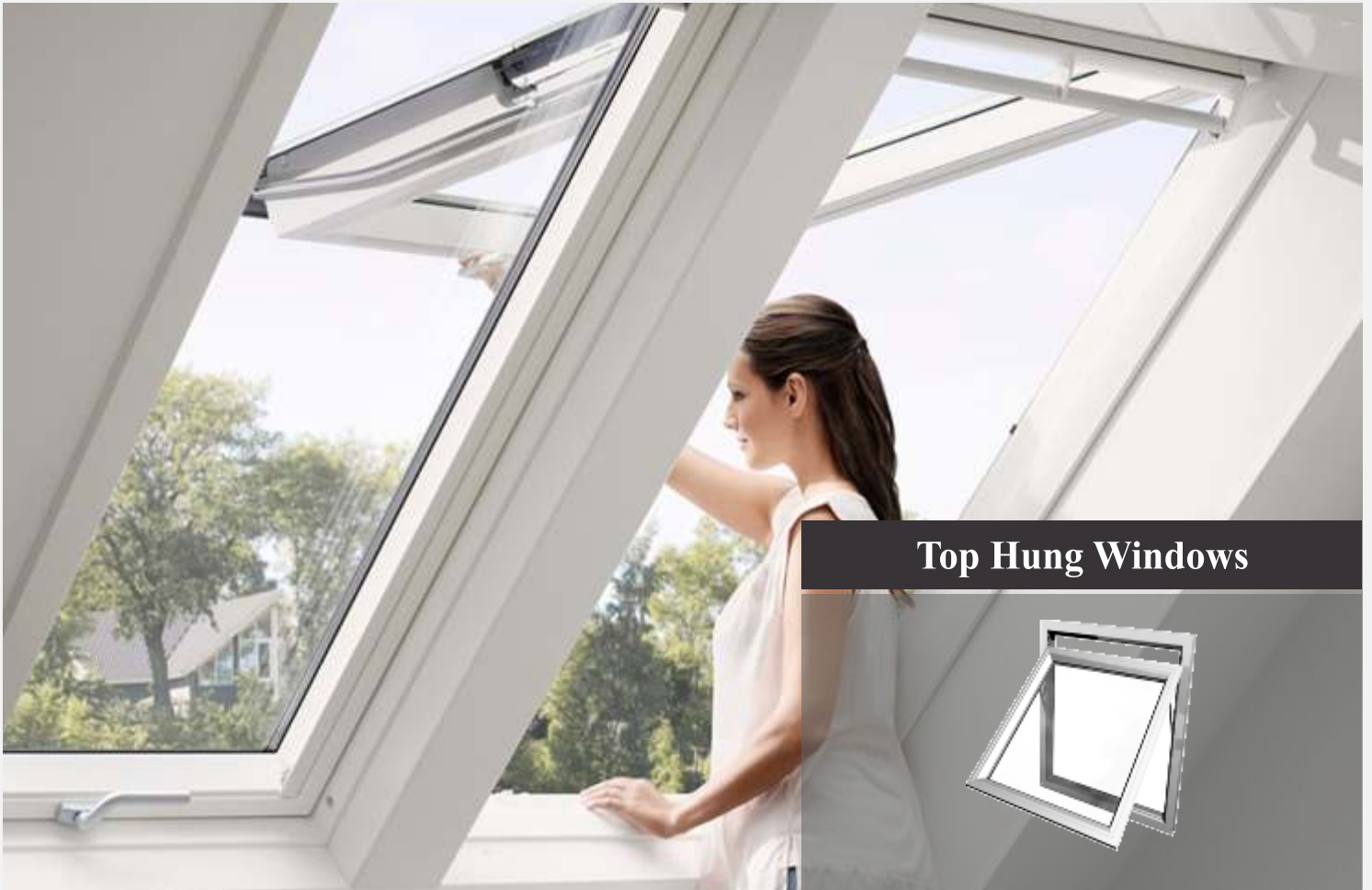
Top Hung Windows