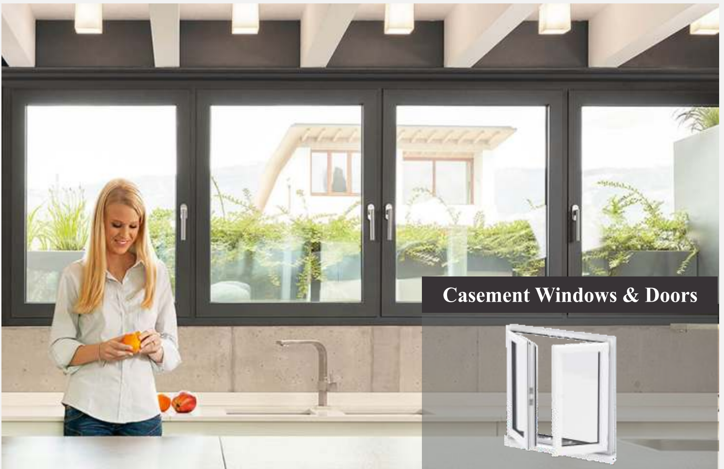
Casement Windows & Doors