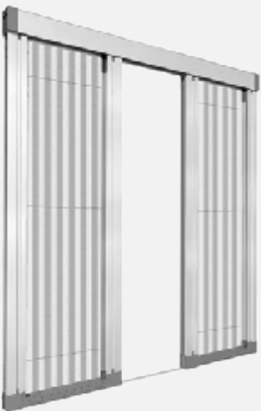
Barrier Free Mesh