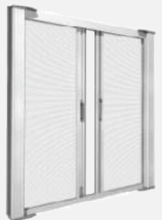
Pleated Double Mesh