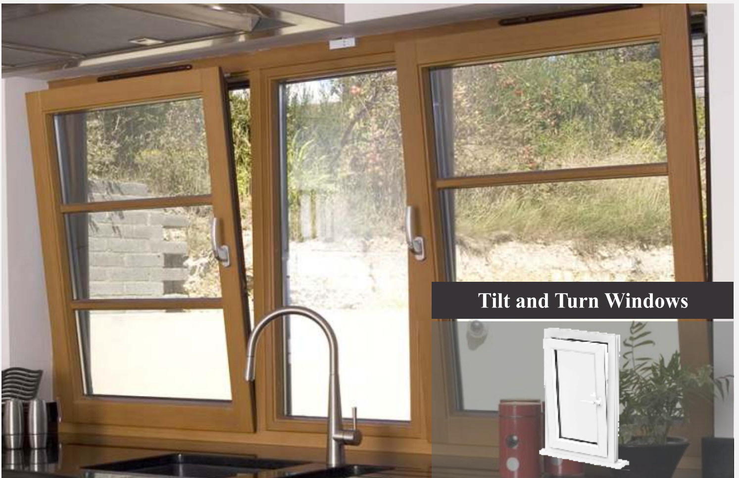
Tilt and Turn Windows